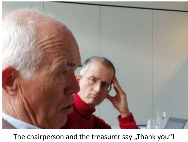
The chairperson and the treasurer say „Thank you“!

Our special thanks go to the PTF Europe members for their generous donations.