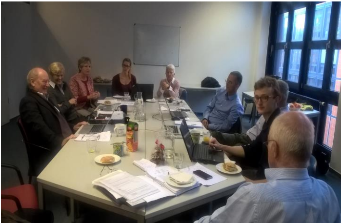
PTF e.V. Members at the membership meeting in December 2015

In 2003, the Washington DC based Partnership for Transparency Fund (PTF) decided to support the establishment of an affiliate organization in Europe (PTF e.V.) in order to attract new members, engage in European anti-corruption networks, develop new partnerships and attract grants and other modes of cooperation, including participation in relevant